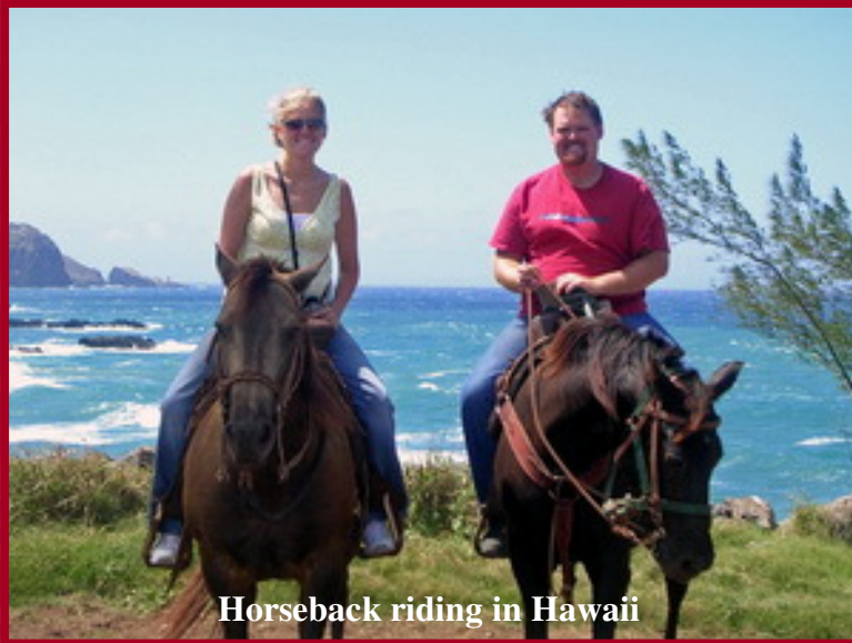
Horseback riding in Hawaii