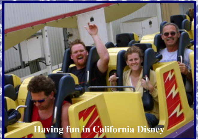
Having fun in California Disney

We love spending time outside. We enjoy going camping and fishing at the nearby lakes. We are looking forward to camping with our little one and teaching him/her to fish and roast marshmallows. We also like to travel and are always up for trying a new destination. Spending time with our families is one of our favorite things to do and we often travel with them. We can't wait to explore America with our child.