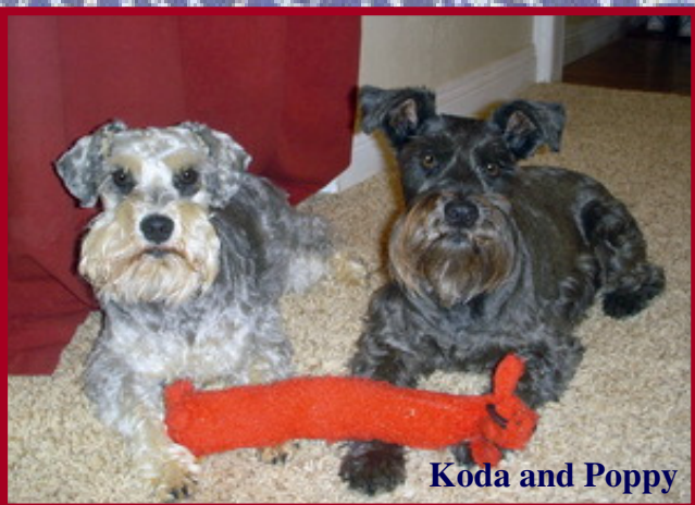
Koda and Poppy